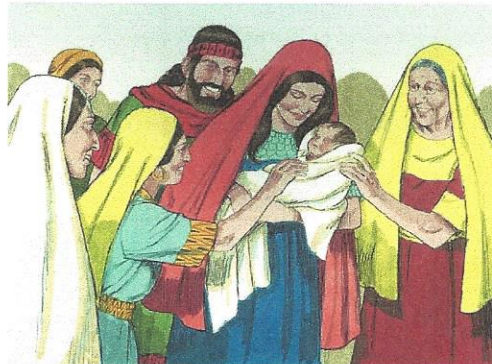
Ruth with her son Obed.

Ruth and Boaz marry. This makes Boaz, Ruth's kinsman-redeemer (a man who follows God's laws in the OT and helps a relative in need or in trouble). They have a son named Obed. When Obed grows up he has a son named Jesse, who is the father of David!