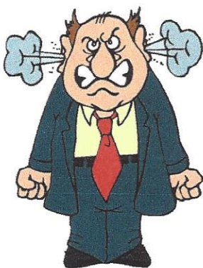
Got mad at God