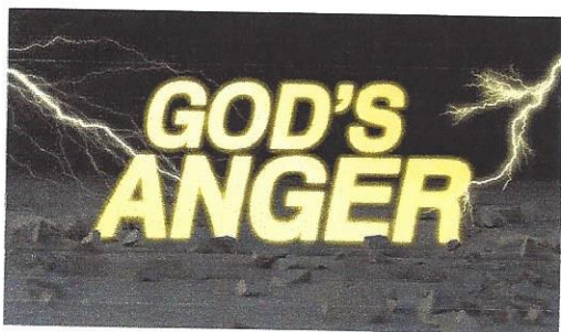
Bad things happened to Job because God was mad at Job.

Even though sad things happened, Job learned something important about God. What do you think he learned?