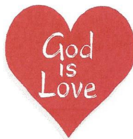
God loved Job even when bad things happen.